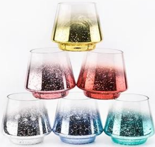
glass candle jar