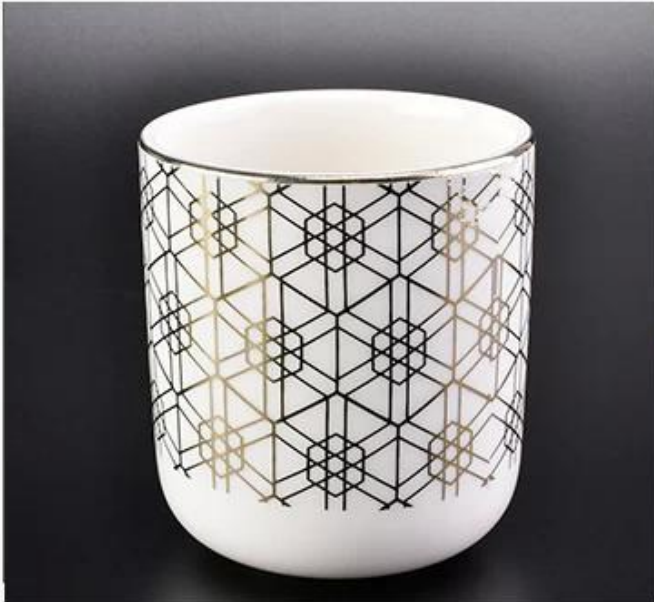
white candle container