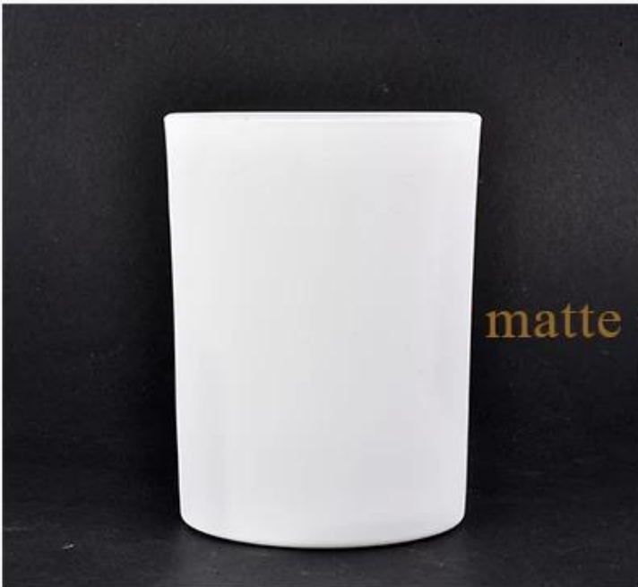
matte white glass candle jar