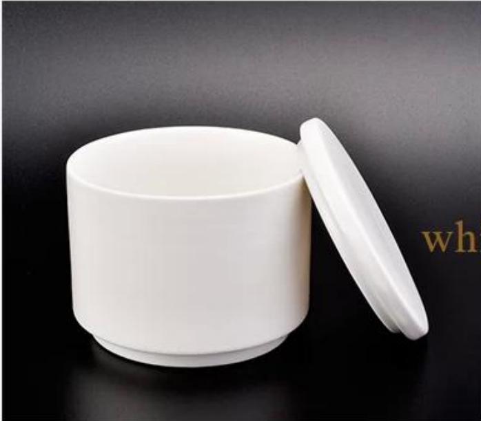
white ceramic candle jar