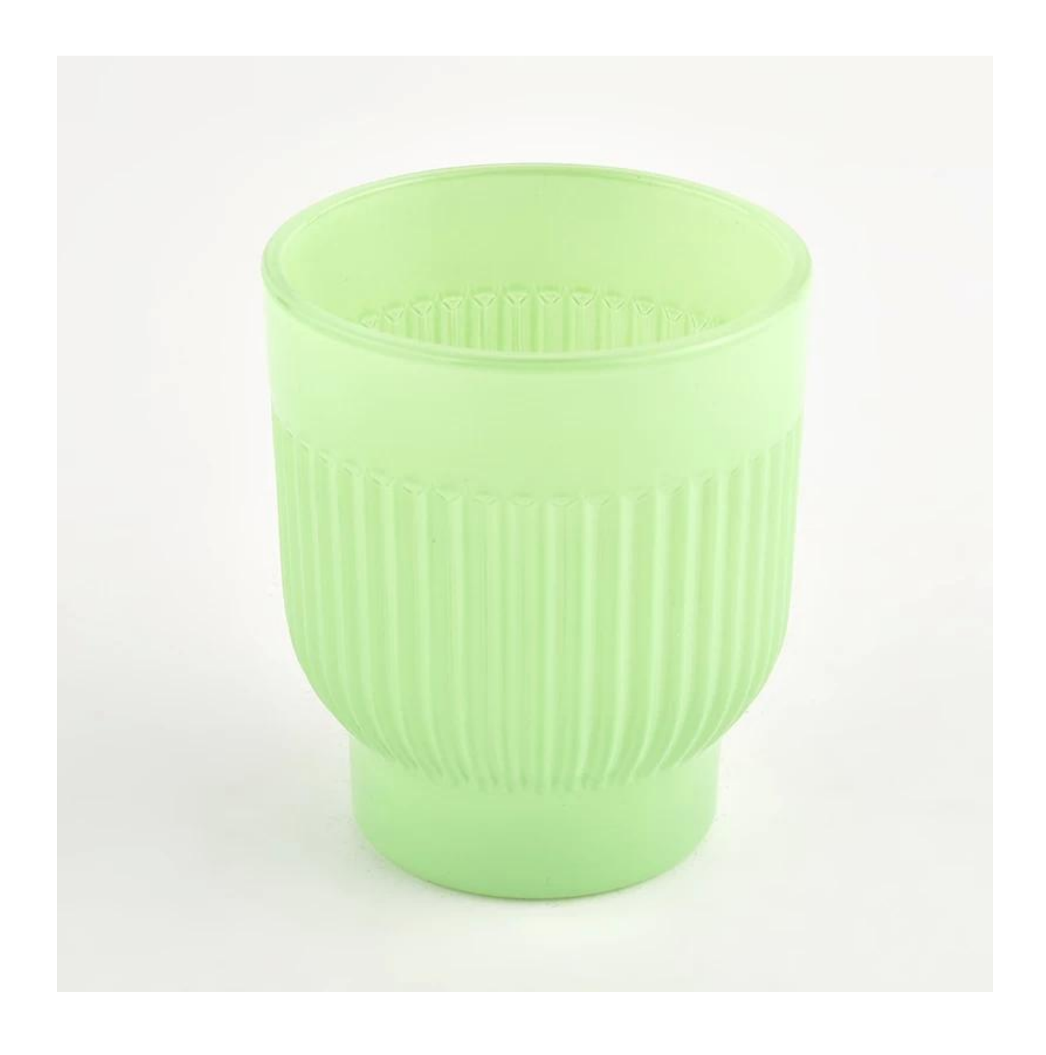
Sunny Glassware Team and Office