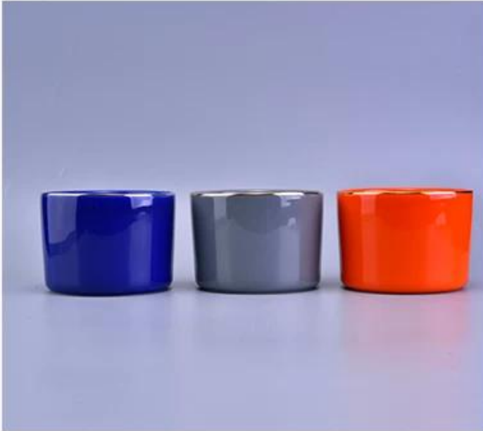
ceramic candle jar