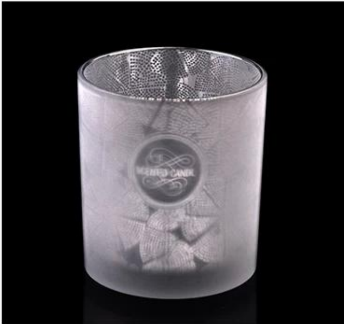
glass candle jar