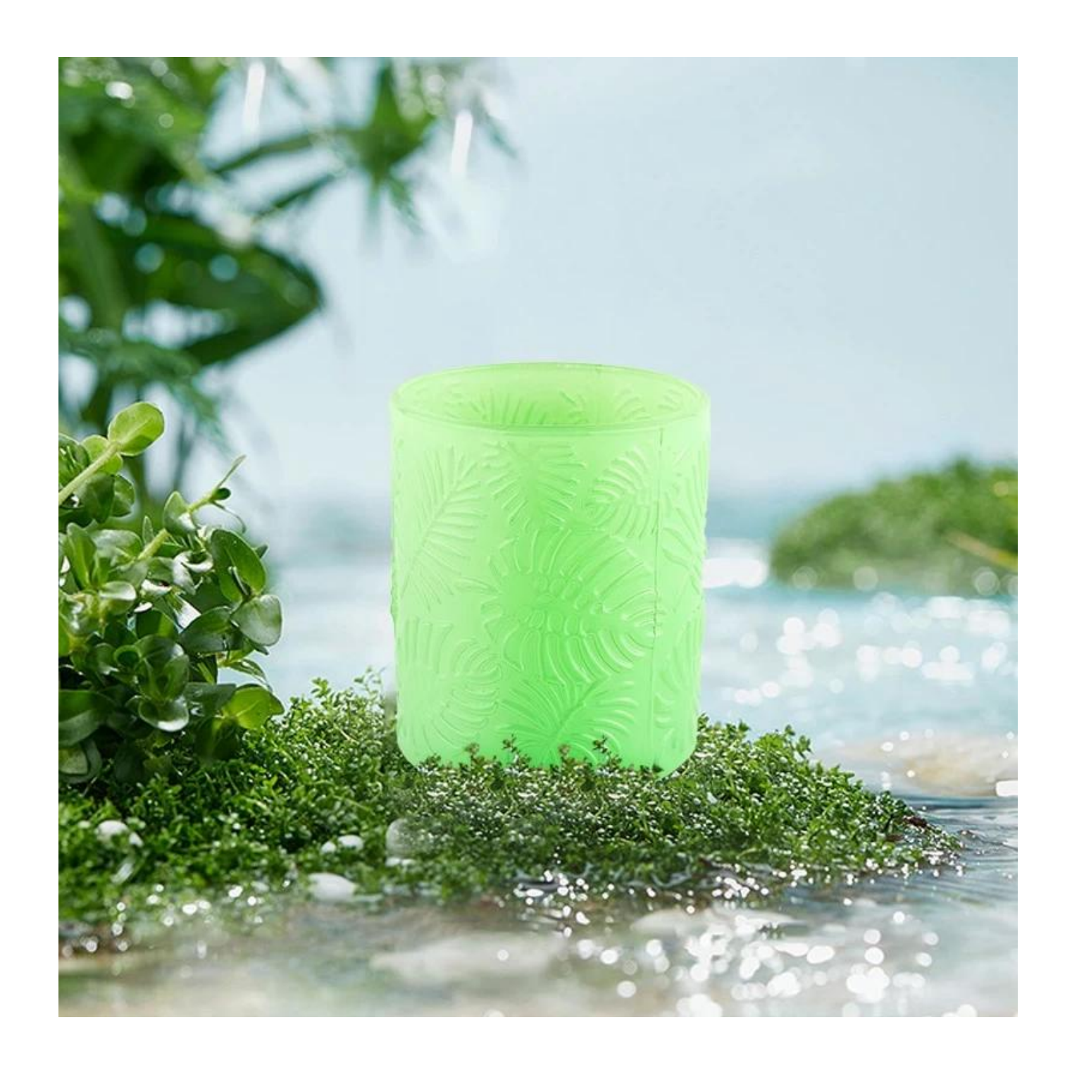
Sunny Glassware Team and Office