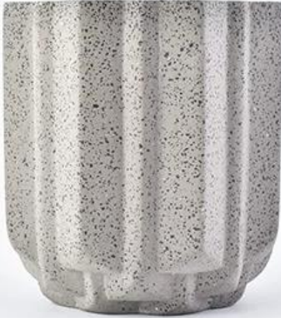
10oz concrete candle jar