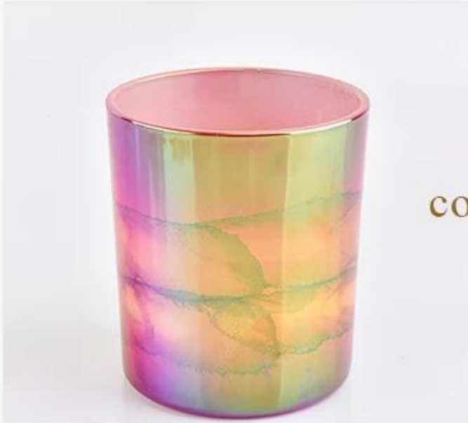
colorful glass candle jar