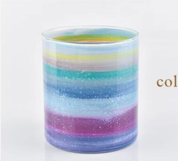
colorful glass candle jar