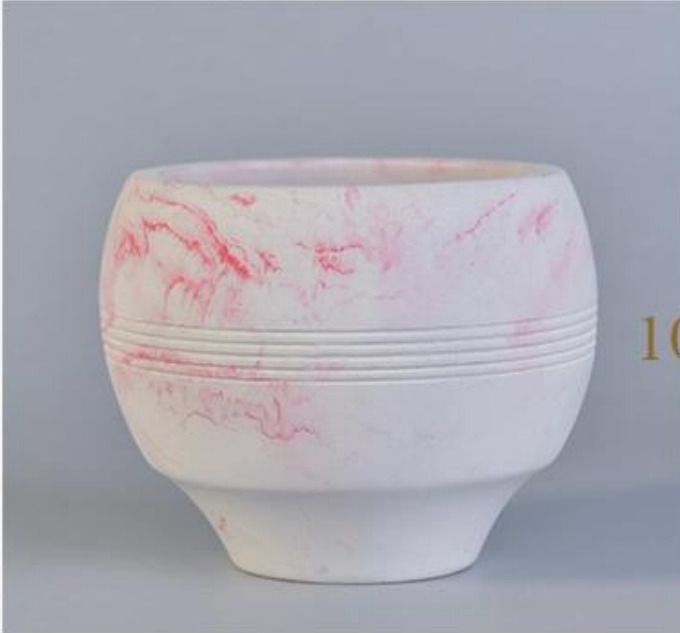
10oz concrete candle jar