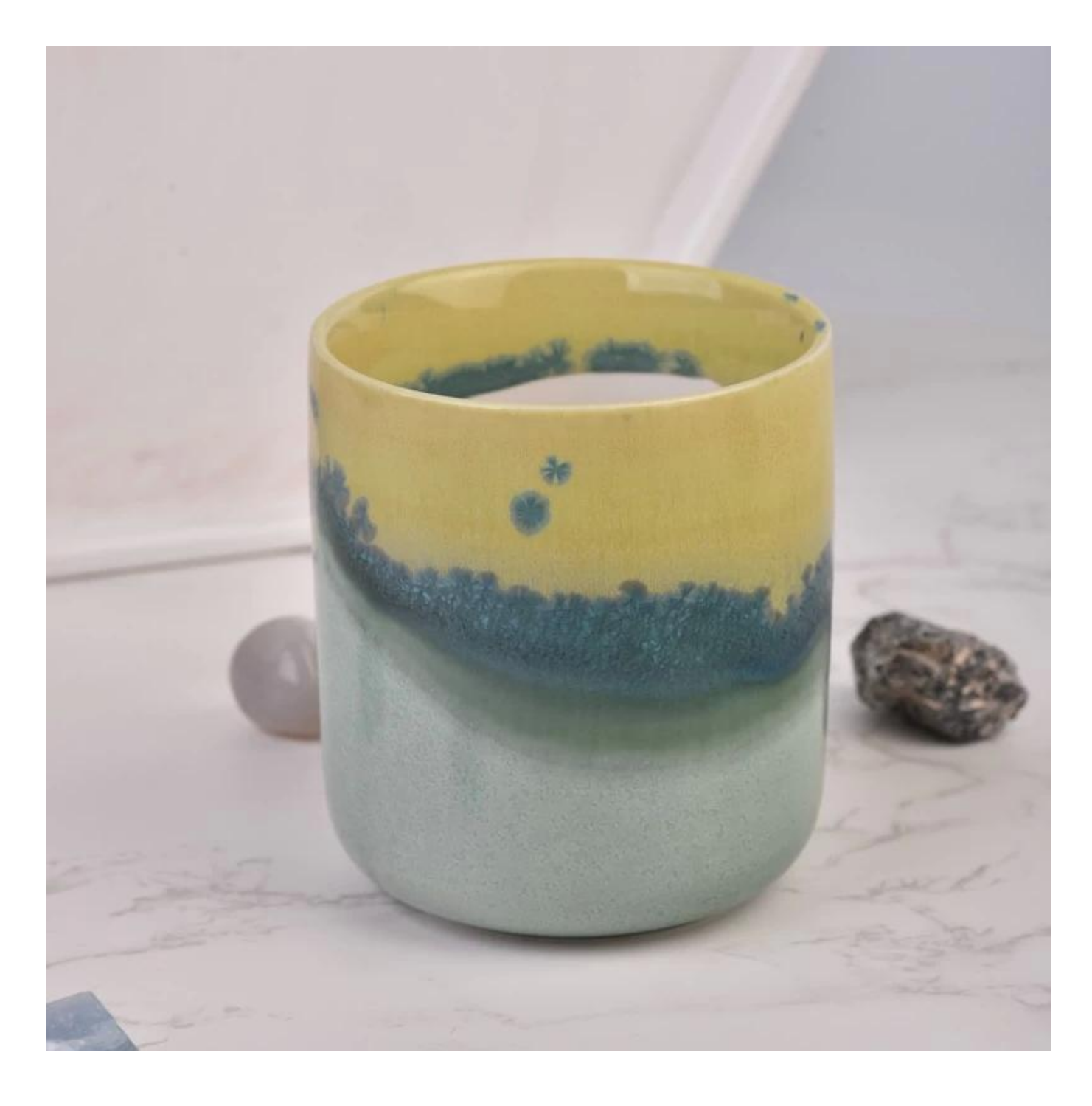
Wide range of application