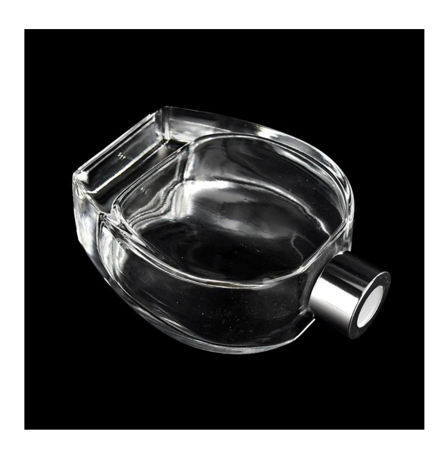
Sunny Glassware Team and Office