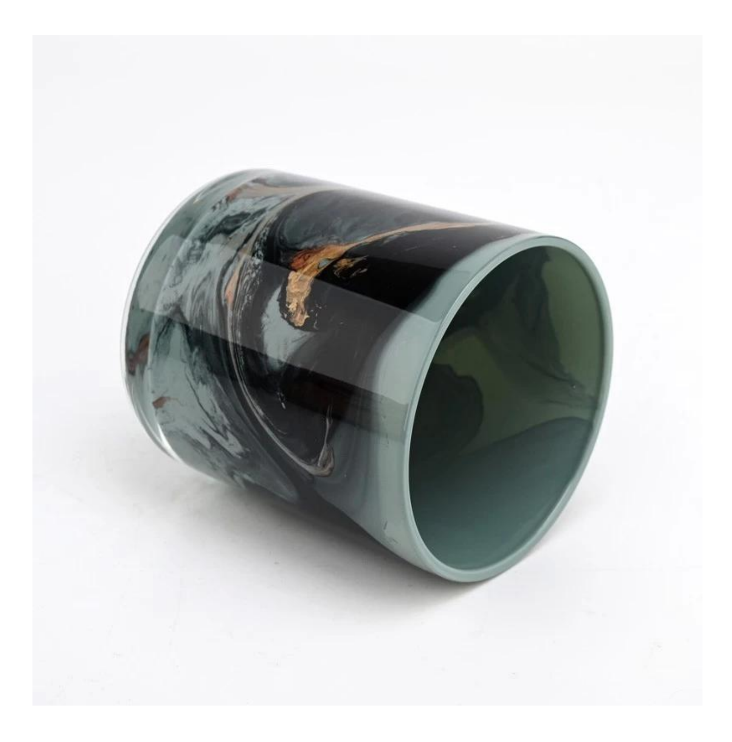
Sunny Glassware Team and Office