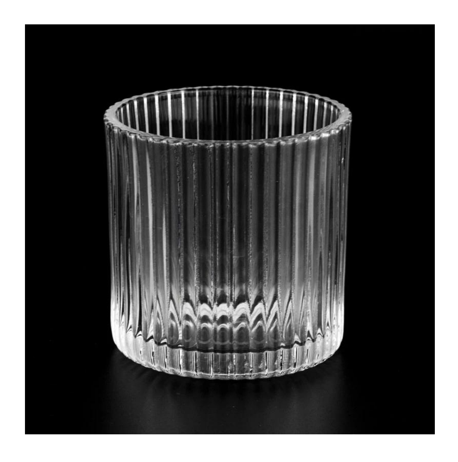
Wide range of application