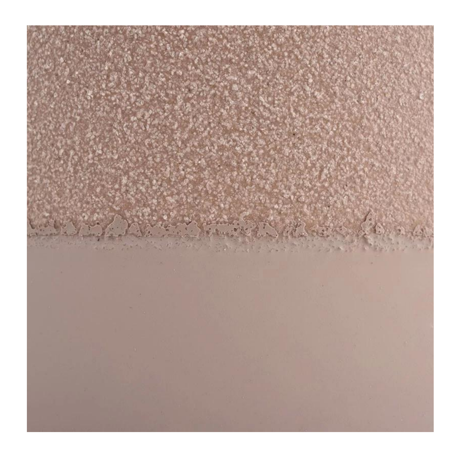
Sunny Glassware Team and Office