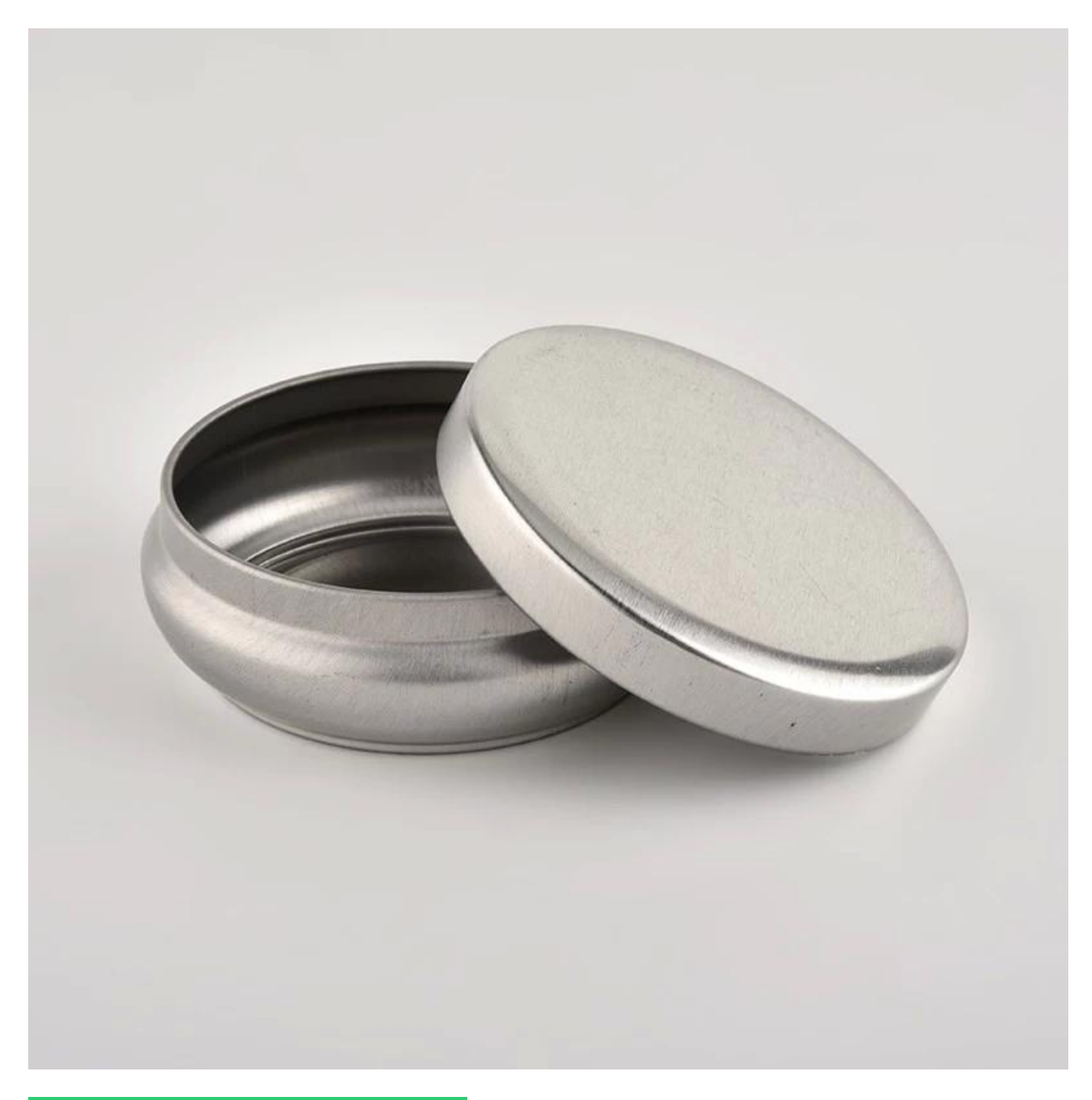
Wide range of application