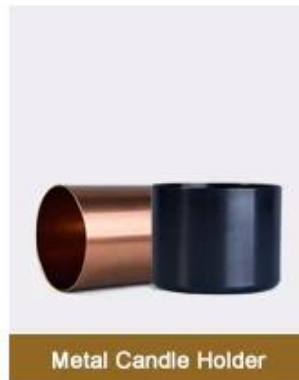
Metal Candle Holder