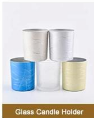
Glass Candle Holder