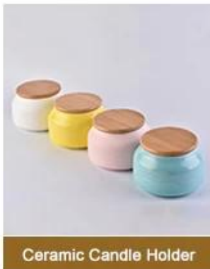
Ceramic Candle Holder