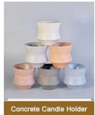
Concrete Candle Holder