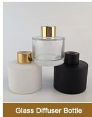
Glass Diffuser Bottle