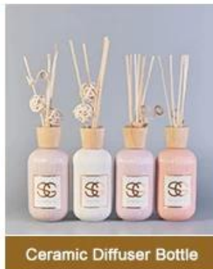
Ceramic Diffuser Bottle

Sunny keep engaged in various of candle holder, bathroom accessories, perfume&diffuser bottles, borosilicate glass and related accessories.