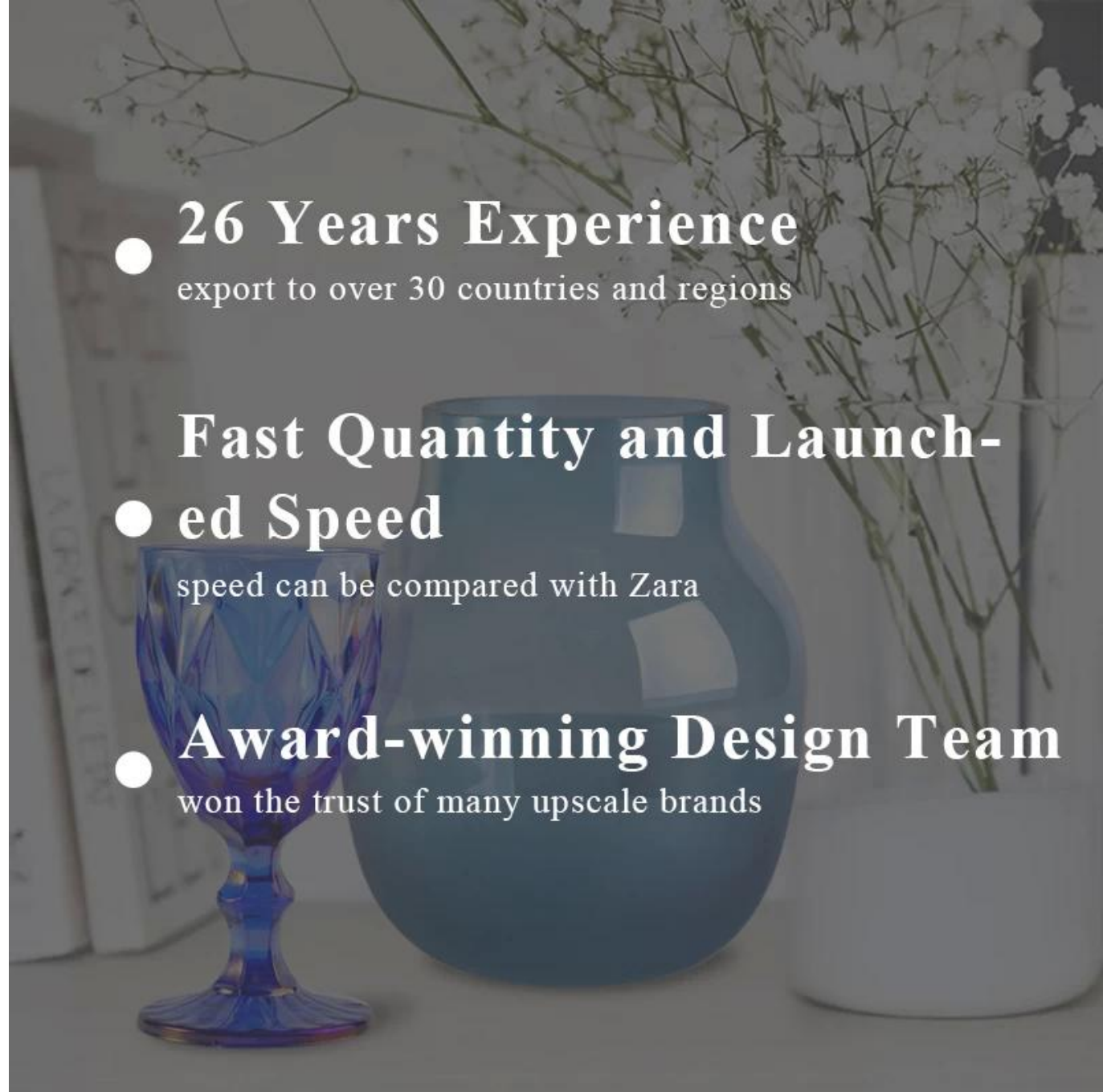
Sunny Glassware can not only perform OEM/ODM orders, but also help many brands from concept design to actual proudcts.

Focusing on luxury fragrance products in the latest 10 years, Sunny Glassware is the supplier of 80% fragrance brands in the United States.