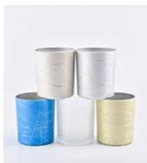
Glass Candle Holder