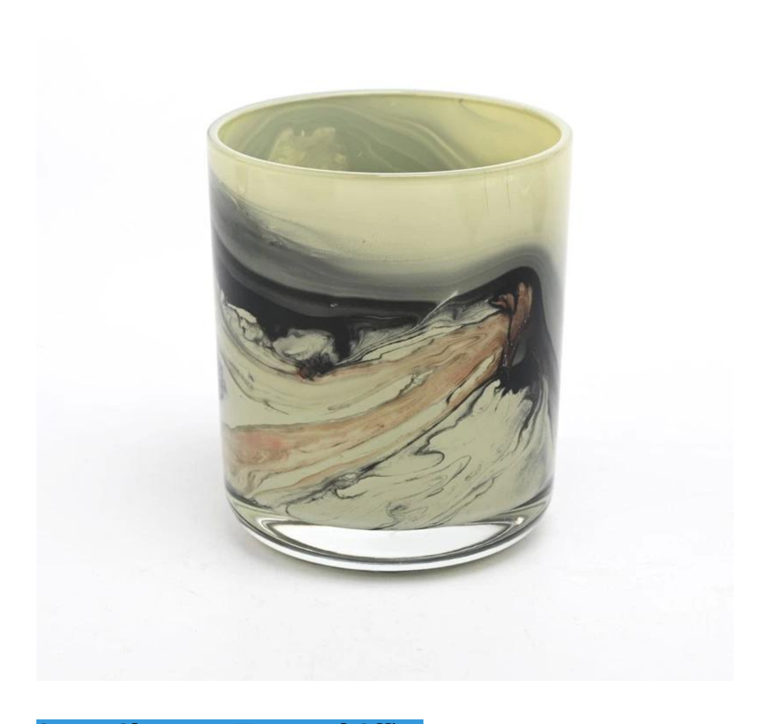
Sunny Glassware Team and Office