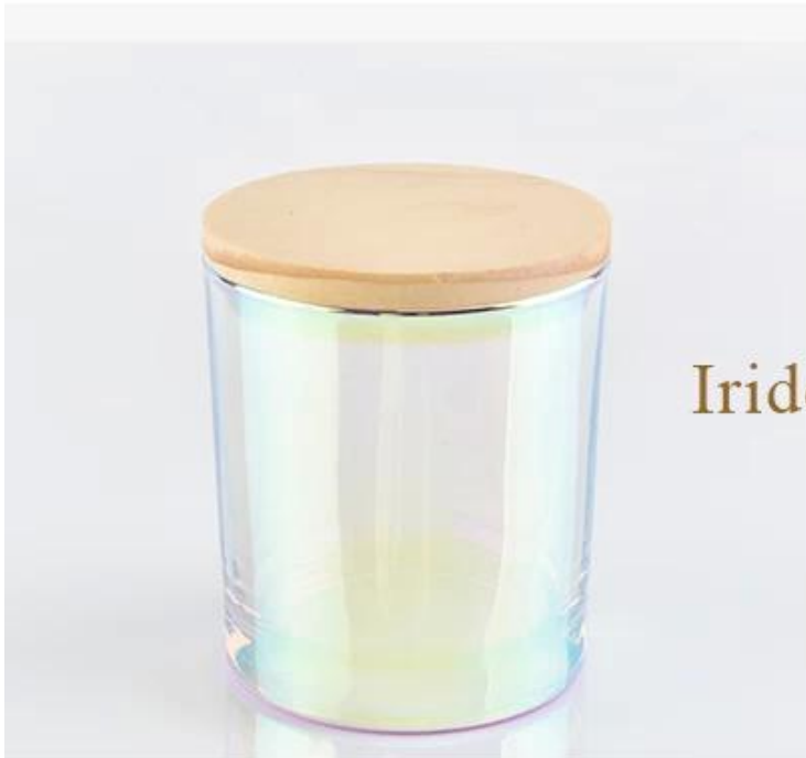
Iridescent glass candle jar

Top dia: 70mm Bottom dia: 65mm Height: 84mm Capacity: 204ml Weight: 246g