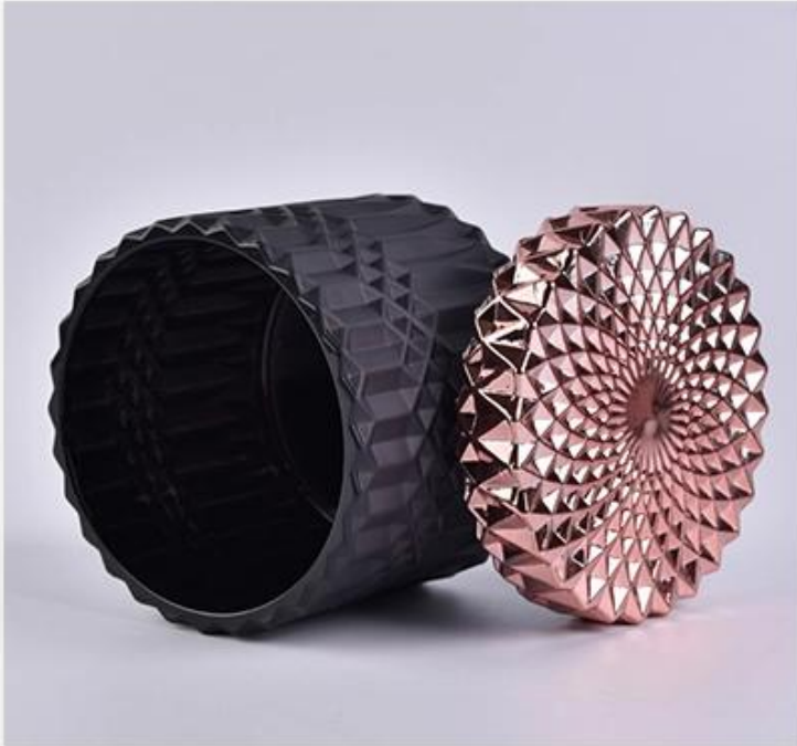
GEO glass candle jar

Top dia: 107mm Bottom dia: 107mm Height: 85mm Weight: 450g Capacity: 495ml