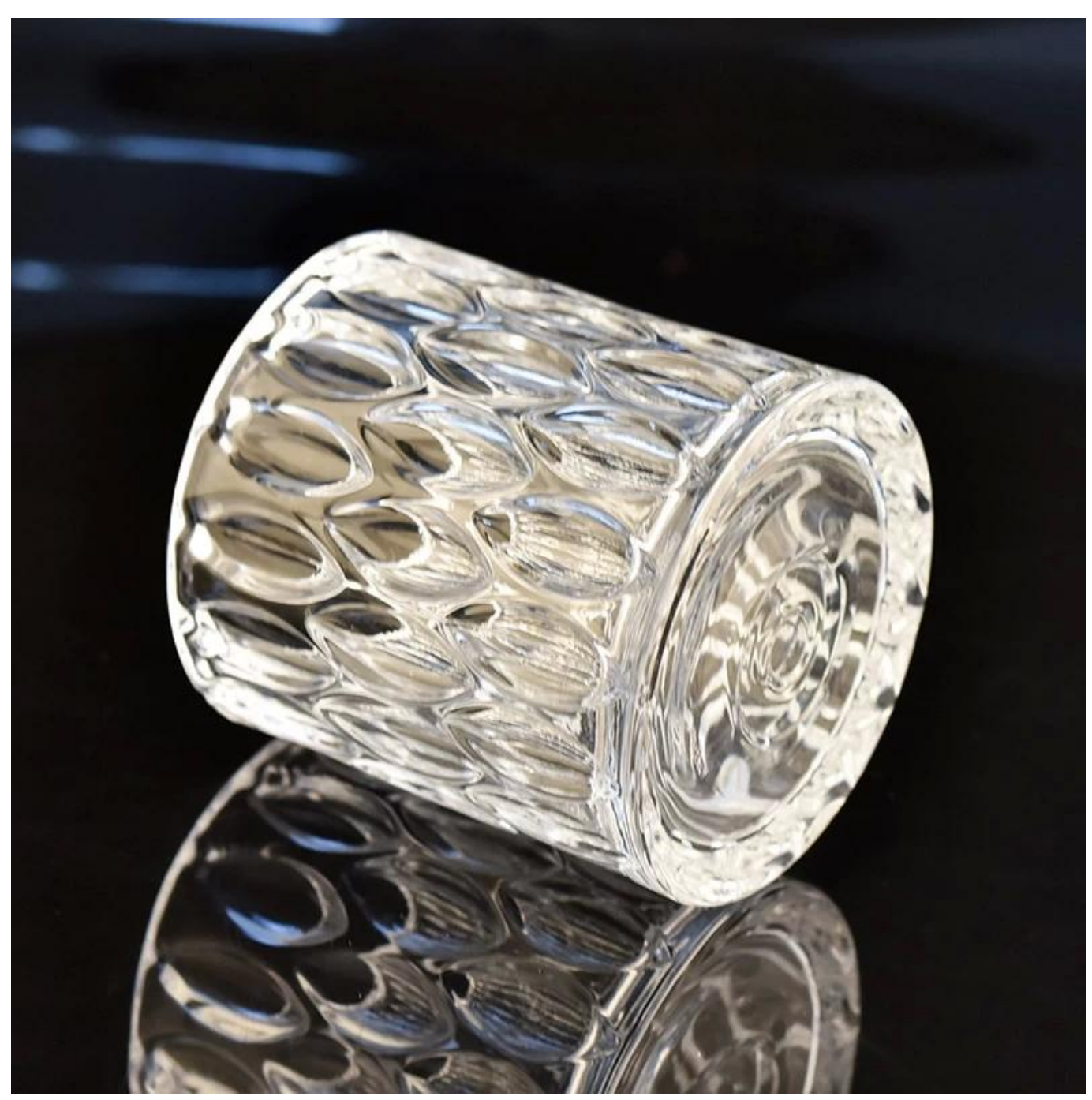
Different luxury surface decoration is our strength as well! Such as electroplating, laser engraving, spraying, decal printing, mercury finished, iridescent and etc.