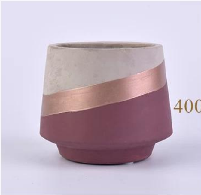
400ml concrete candle jar