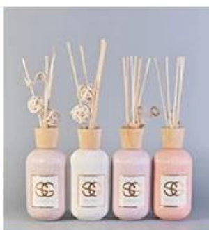
Ceramic Diffuser Bottle

Sunny keep engaged in various of candle holder, bathroom accessories, perfume&diffuser bottles, borosilicate glass and related accessories.