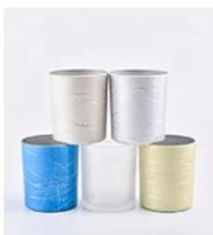
Glass Candle Holder