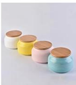
Ceramic Candle Holder