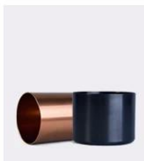
Metal Candle Holder