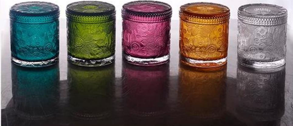
glass candle jar with lid