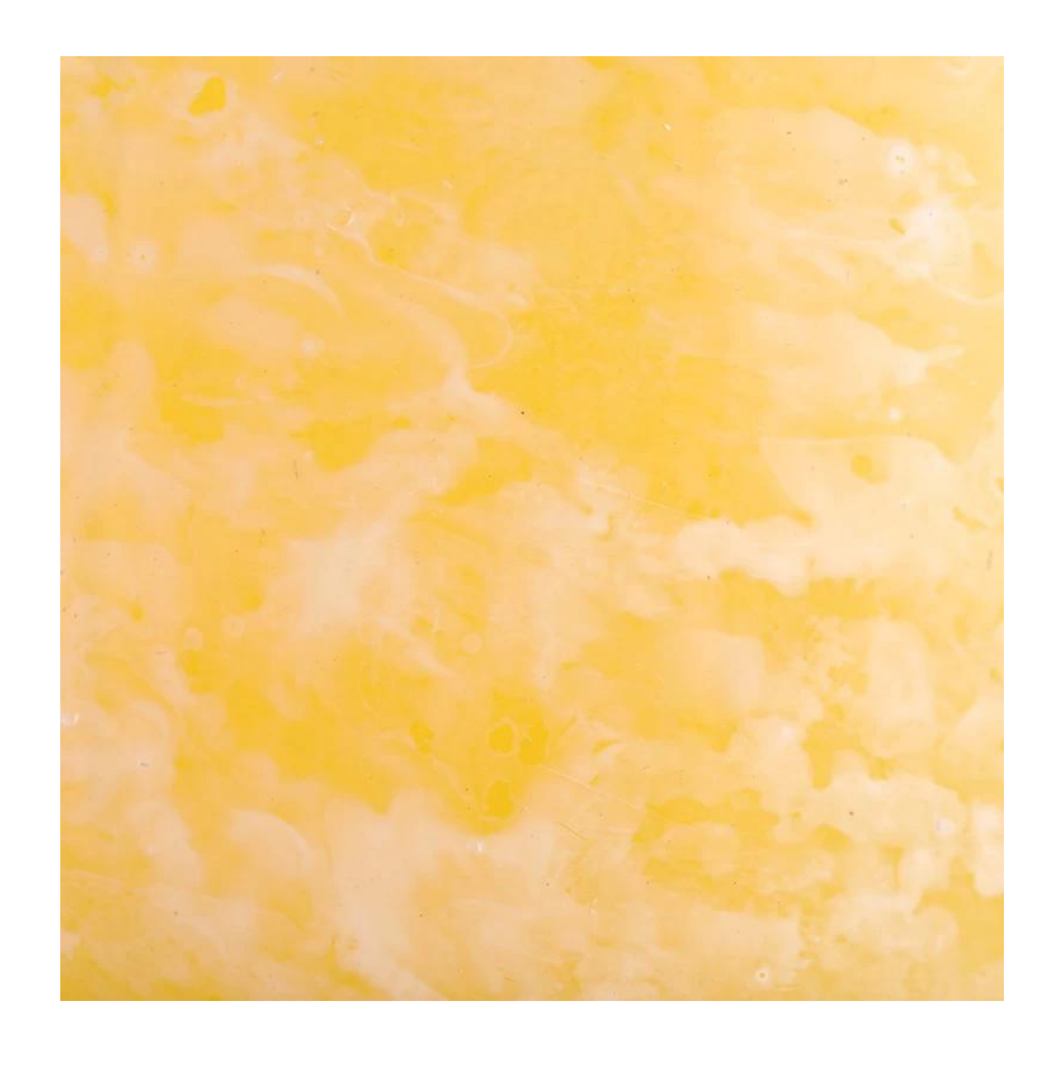
Sunny Glassware Team and Office