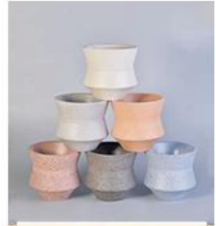
Concrete Candle Holder