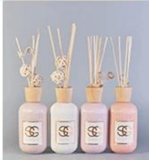
Ceramic Diffuser Bottle

Sunny keep engaged in various of candle holder, bathroom accessories, perfume&diffuser bottles, borosilicate glass and related accessories.