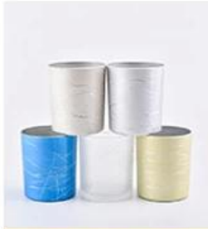
Glass Candle Holder