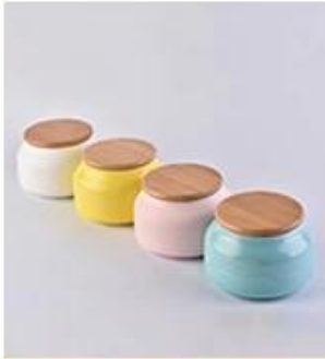
Ceramic Candle Holder