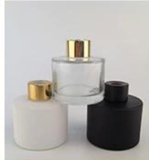
Glass Diffuser Bottle