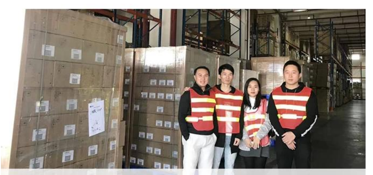
20+ years freight history and WCA members.