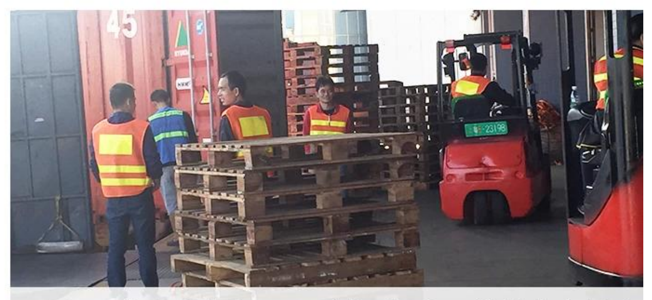
Own professional shipping company( Shenzhen Sunny Worldwide logistics)