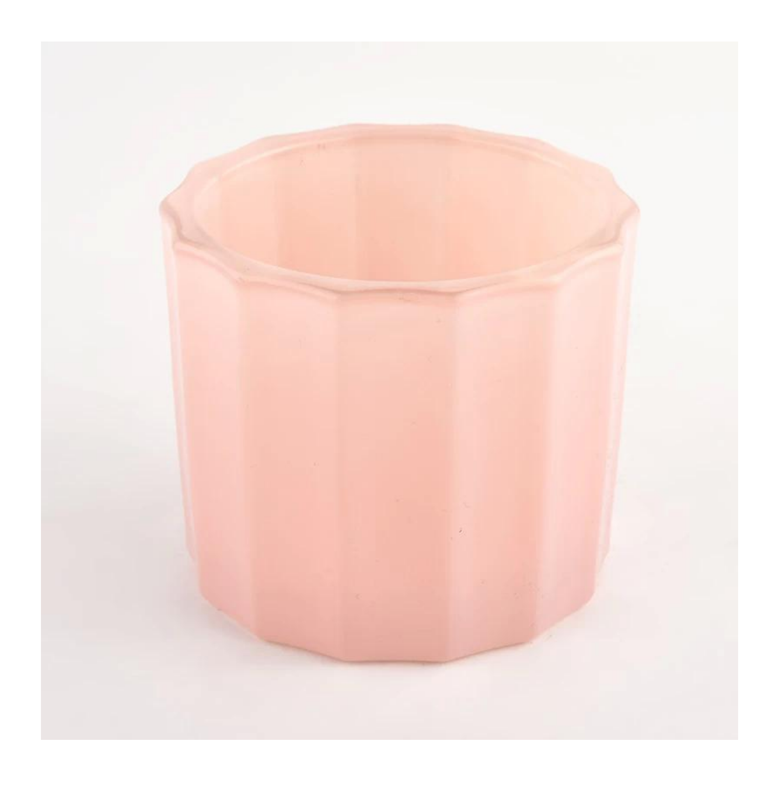
Sunny Glassware Team and Office