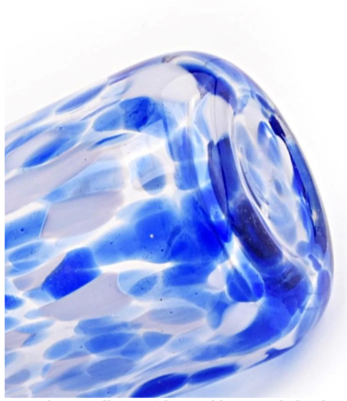
20oz glass candle jar with round bottom wholesale