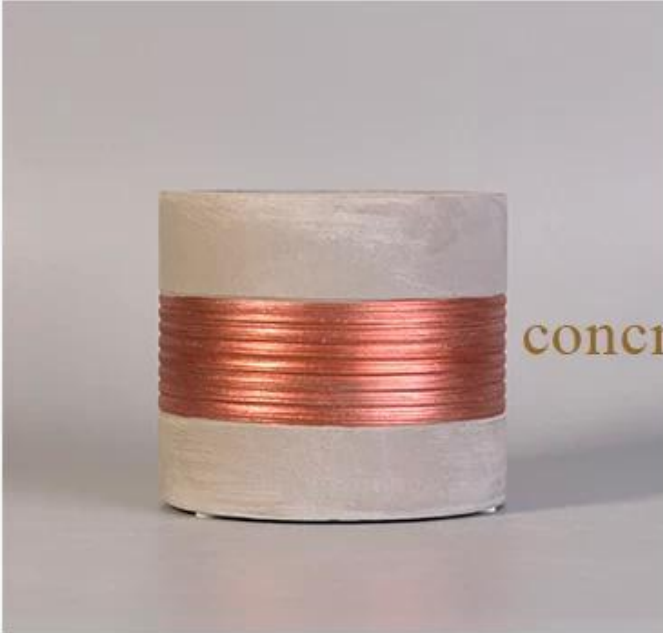
concrete cylinder candle jar