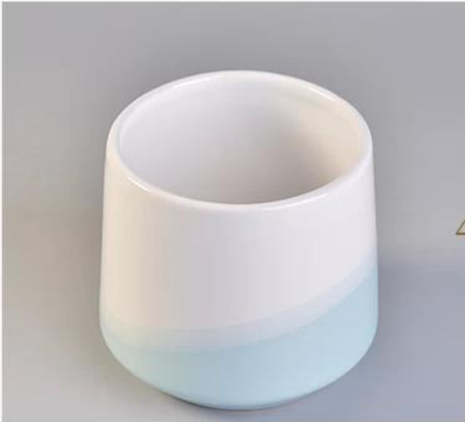
450ml candle container