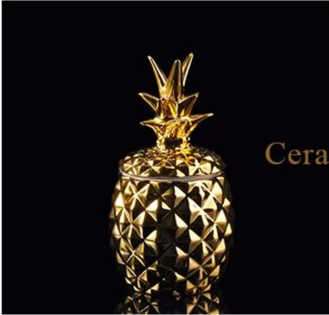
Ceramic candle jar with lid

Top dia: 117mm Lid: Bottom dia:95mm Dia: 115mm Height:126mm Height:143mm Capacity: 1110ml Weight:219g Weight:439g