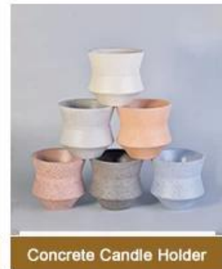
Concrete Candle Holder