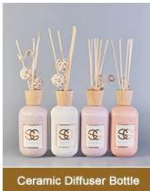
Ceramic Diffuser Bottle

Sunny keep engaged in various of candle holder, bathroom accessories, perfume&diffuser bottles, borosilicate glass and related accessories.