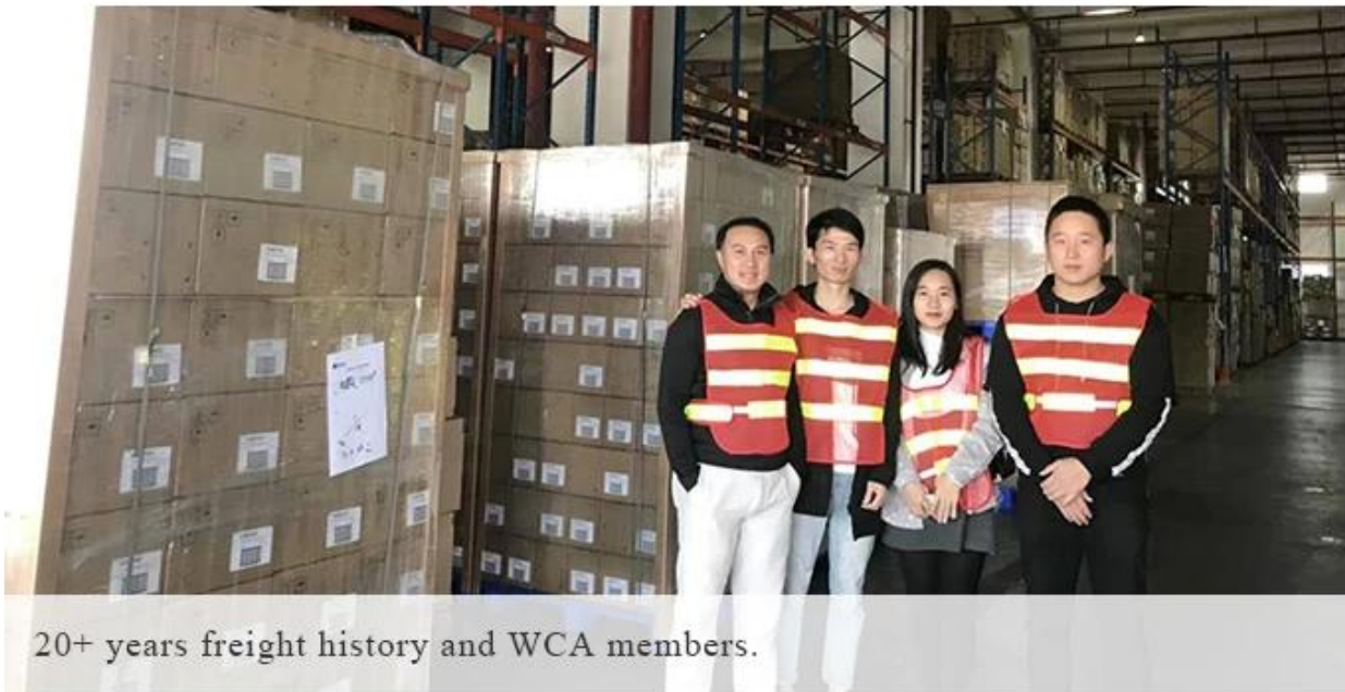
20+ years freight history and WCA members.