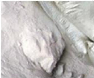
1、 Raw Material