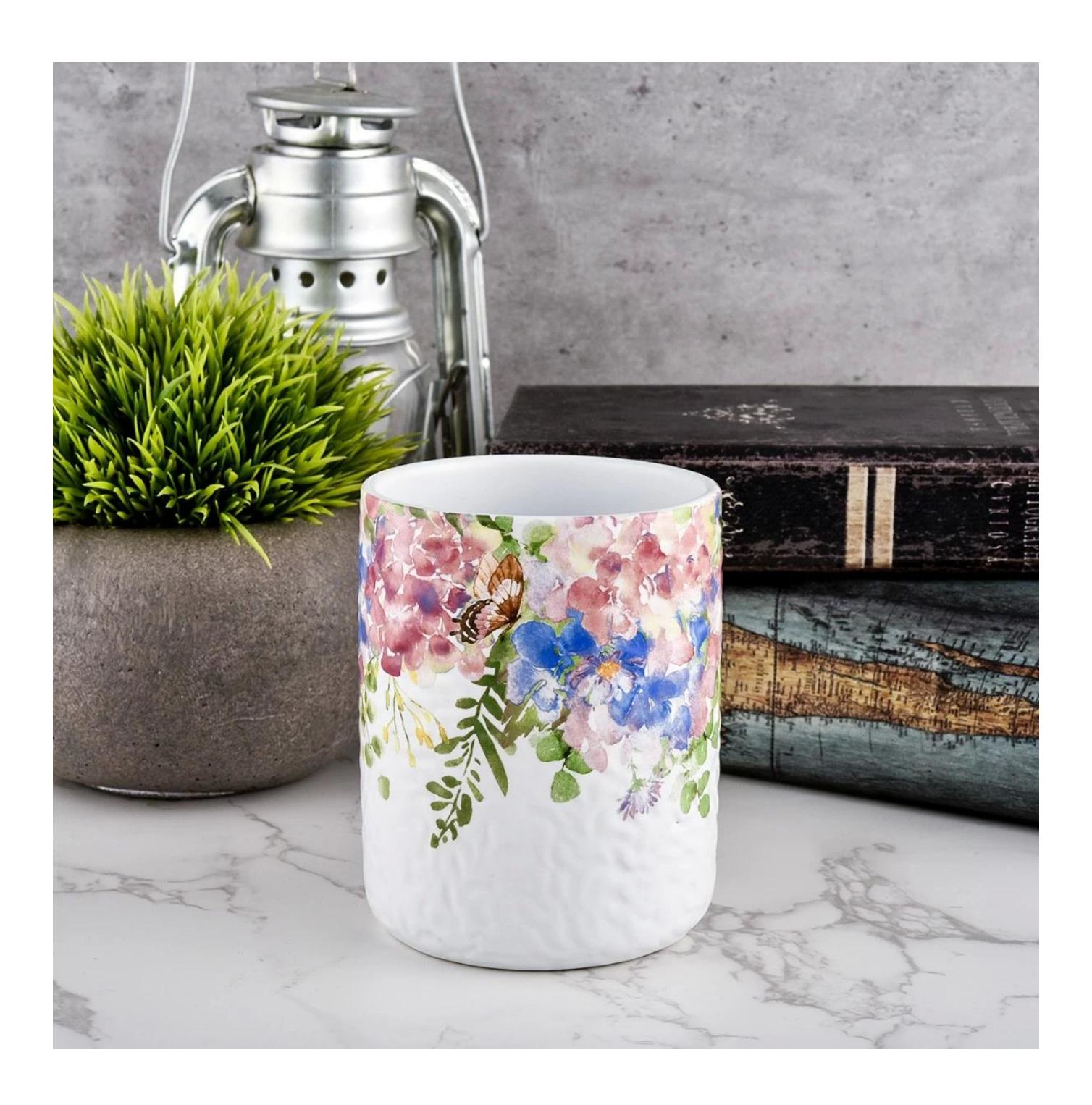
Why Choose Sunny Glassware