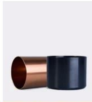
Metal Candle Holder