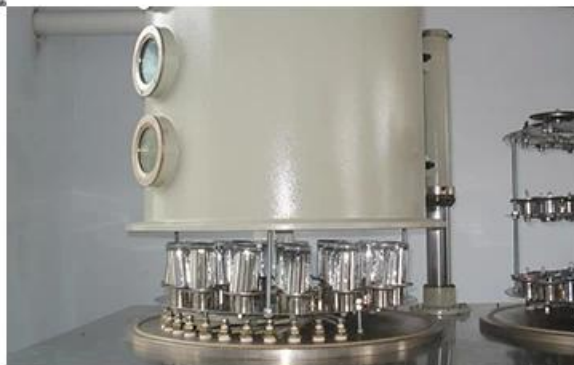
04 VACUUM ELECTROPLATING