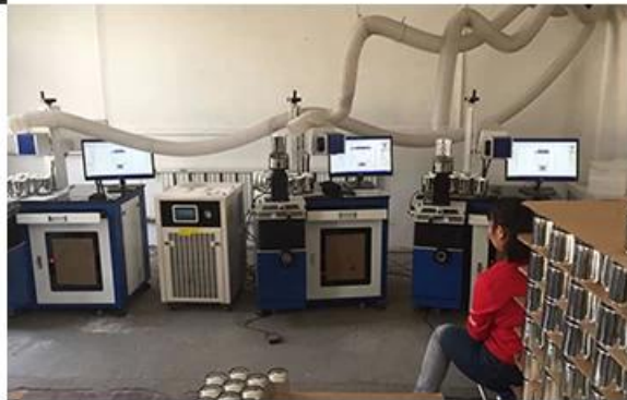
02 LASER ENGRAVING