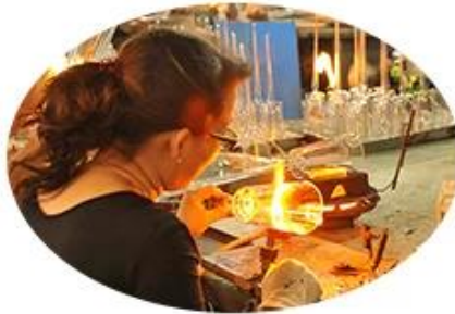
Put on handle