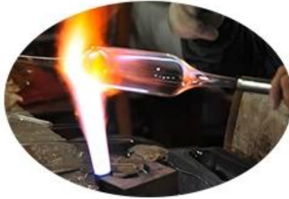
Mouth Blown Moulding