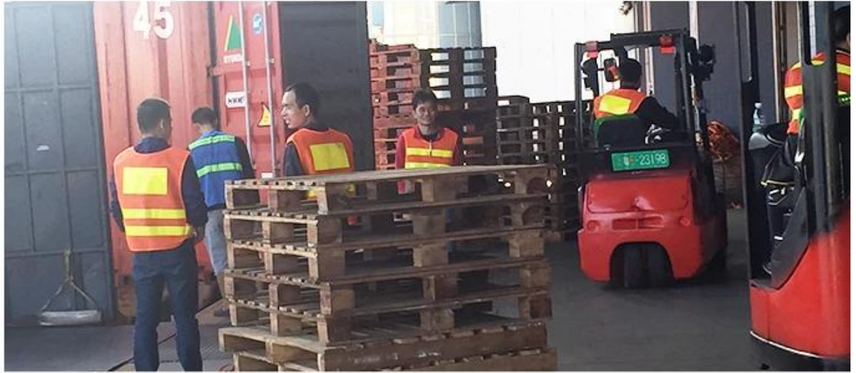
Own professional shipping company( Shenzhen Sunny Worldwide logistics)