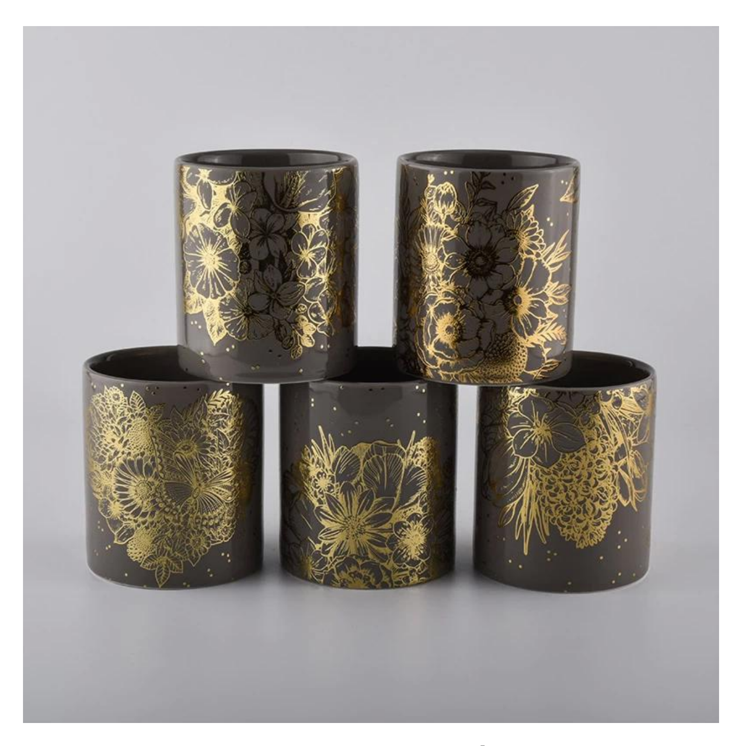
Different luxury surface decoration is our strength as well! Such as electroplating, laser engraving, spraying, decal printing, mercury finished, iridescent and etc.